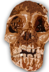
Australopithecus africanus Taung 1