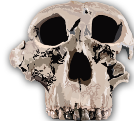
Paranthropus boisei OH 5